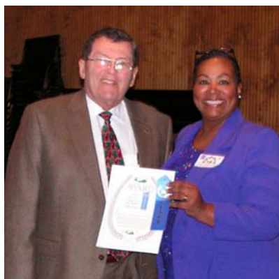
Sweet Potato Casserole