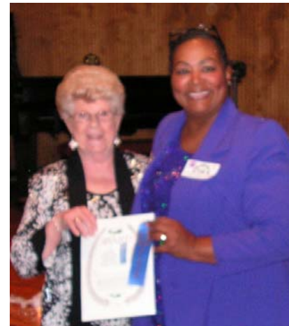
Cream Cheese Dessert

Dry grapes well on paper towel. (If grapes are not dry, dish may get runny) Place in a bowl Using a mixer, mix remaining ingredients well and pour over grapes. Stir and refrigerate. Can be made the day before.