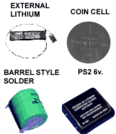
Above pictures not actual size

DO YOU KNOW WHAT TYPE CMOS BATTERY IS IN YOUR COMPUTER?